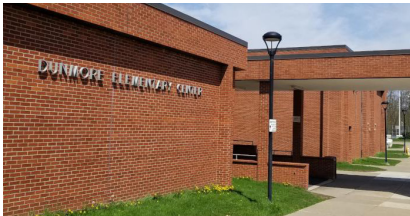
Dunmore School District Project cost: $10.1 Million Project savings: $200,000/YR # Phases: 3