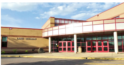
Lake-Lehman School District Project cost: $2,110,624 Project savings: $124,000/YR