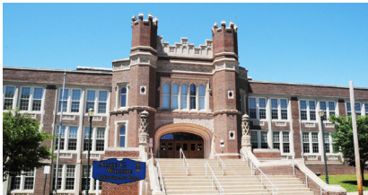
Hazleton School District Project cost: $16 Million Project savings: $670,000/YR # Phases: 2