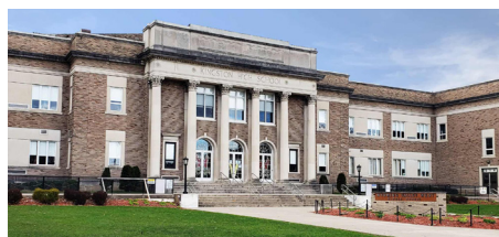
Wyoming Valley West School District Project cost: $2.2 Million Project savings: $120,000/YR # Phases: 1