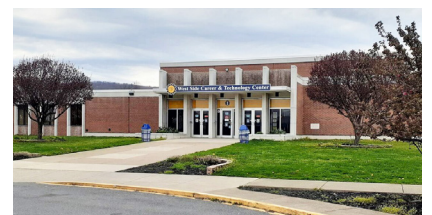
West Side Career & Tech. Center Project cost: $1.7 Million Project savings: $183,000/YR # Phases: 1