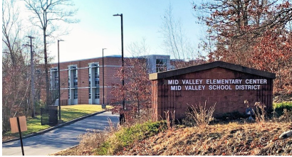
Mid Valley School District Project cost: $8,229,262 Project savings: $175,975/YR # Phases: 2